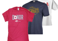
Donor Shirts 300 Points