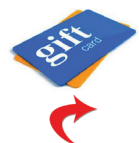
$20 Gift Card 1,500 points

Amazon Best Buy Cafe Rio Home Depot iTunes Starbucks Target Uinta Golf Walmart