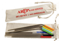
Stainless Straws 600 points