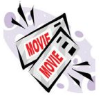
Movie Ticket 600 points