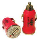
USB Car Charger 200 points

Below are just some of the items available in our rewards store. Each whole blood donation earns you 200 points and each platelet donation earns you 800 points. Check our online FAQ section for donor bonus days around the holidays to earn even more points!